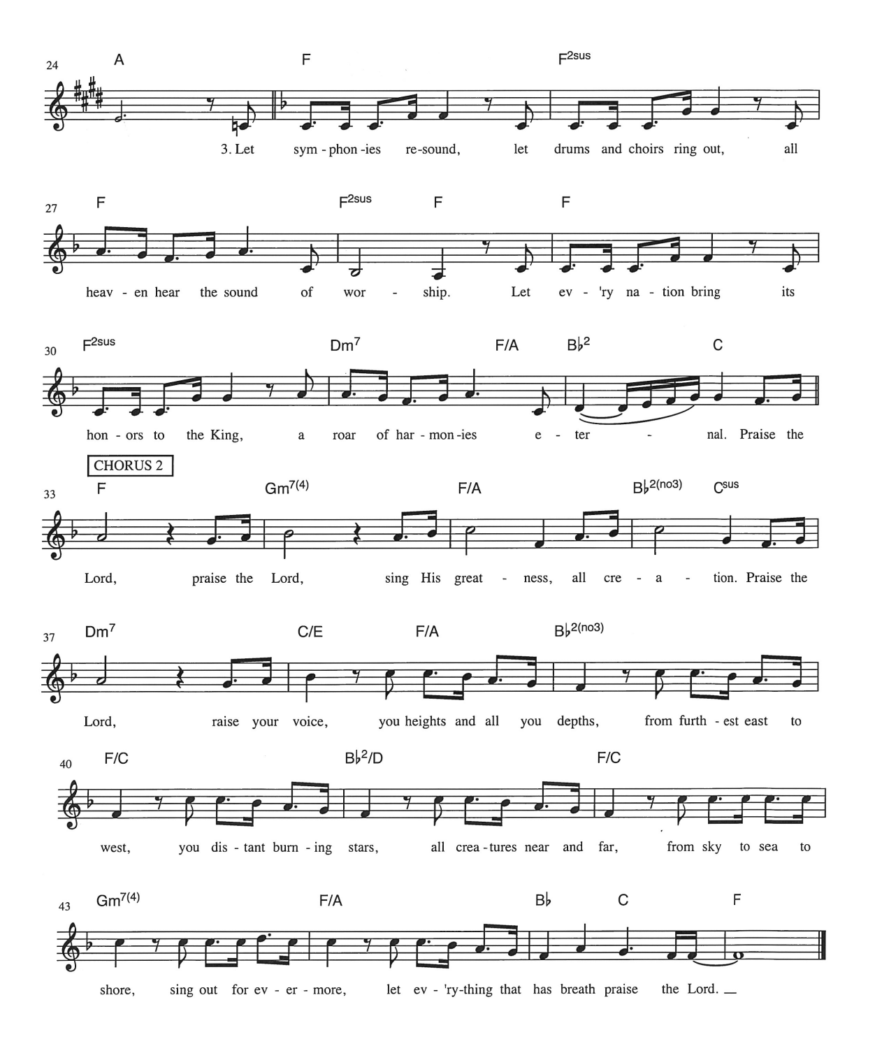
Praise to the Lord, the Almighty Trinity Hymnal #53