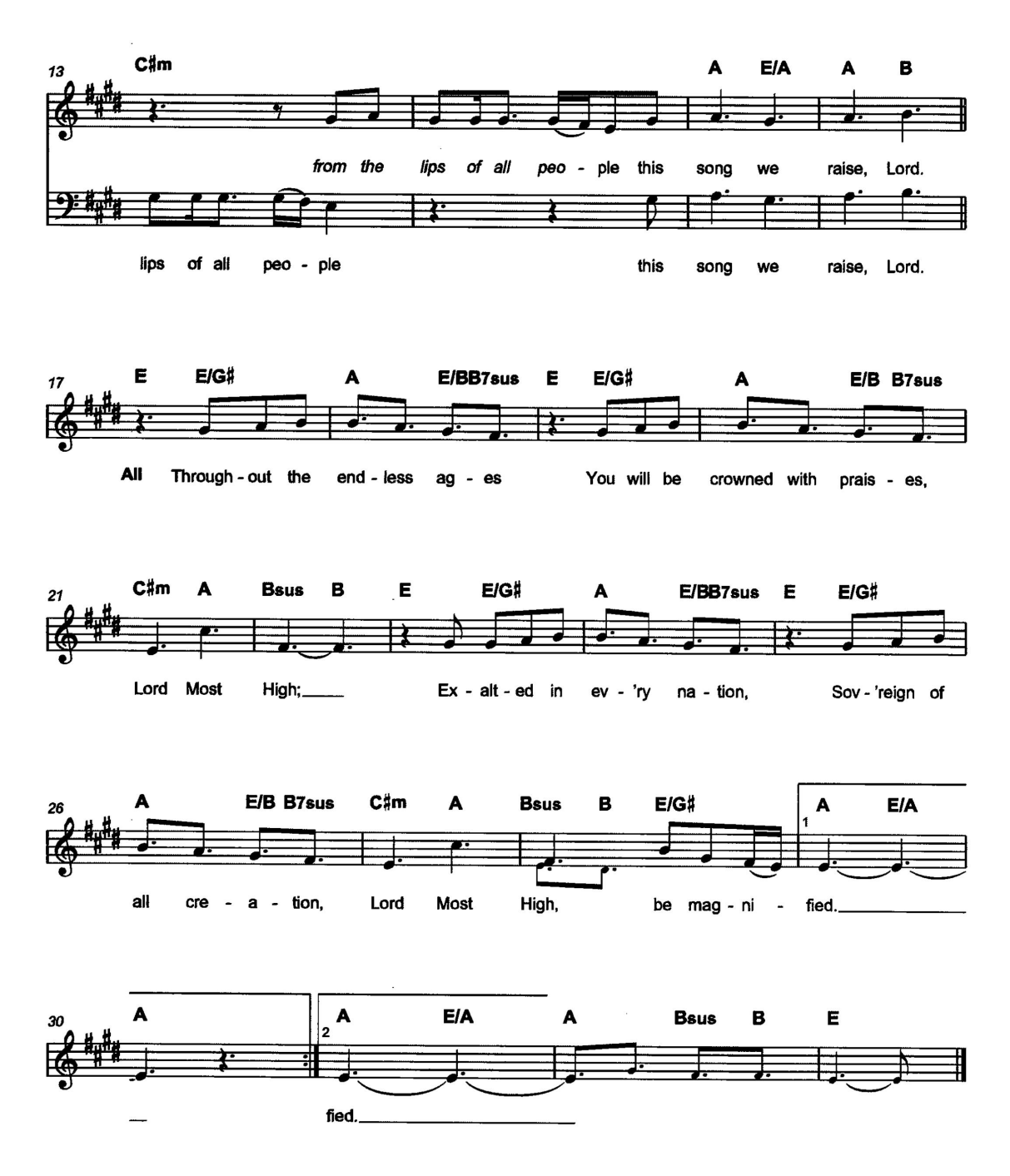
*Prayer of Adoration