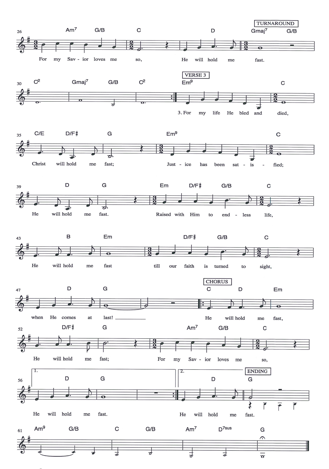
*Prayer of Adoration