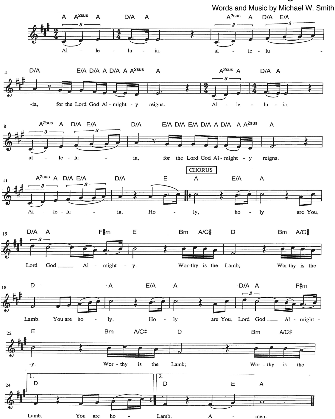
*Prayer of Adoration