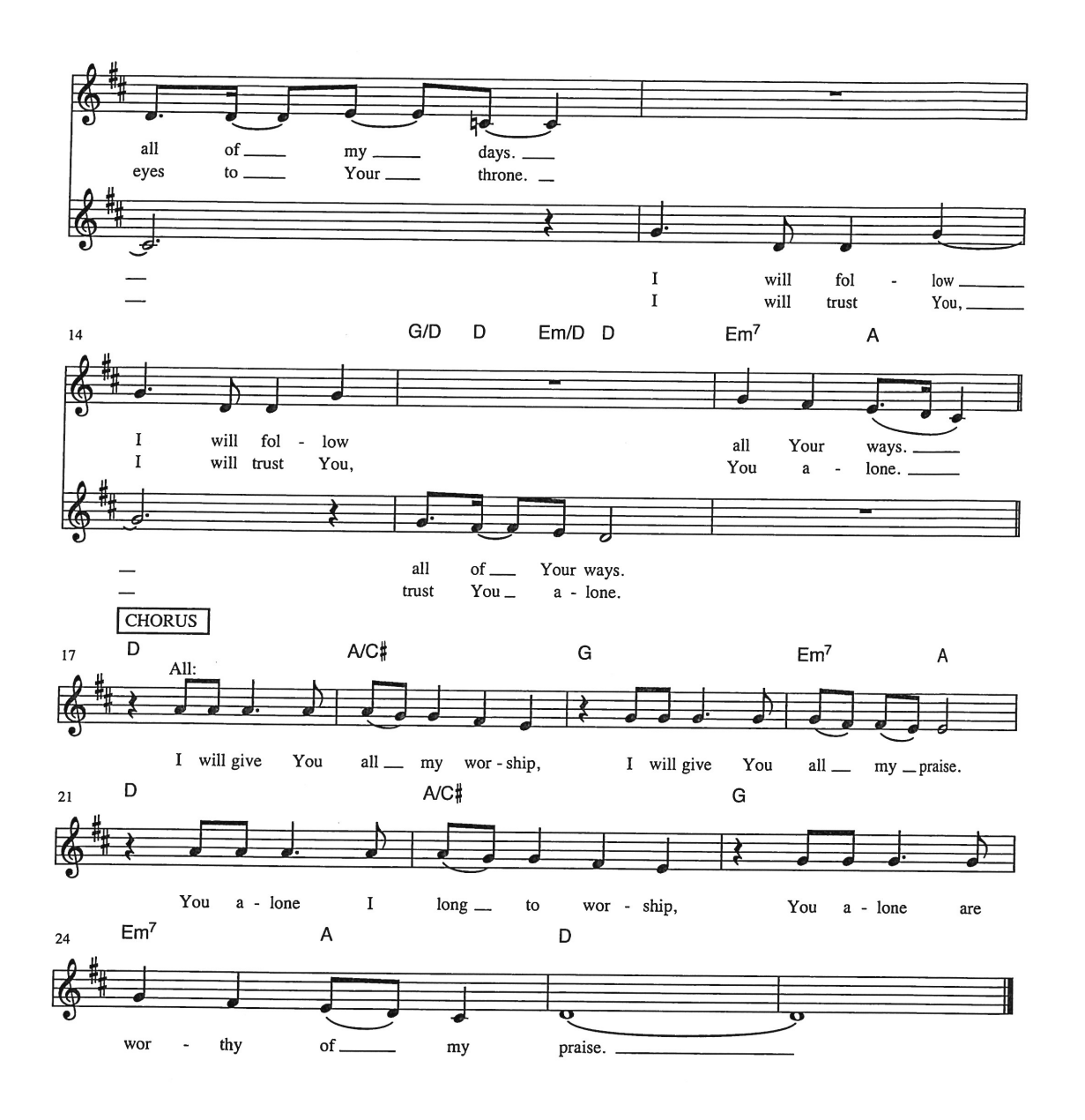
Praise, My Soul, the King of Heaven Trinity Hymnal #77 (different tune)