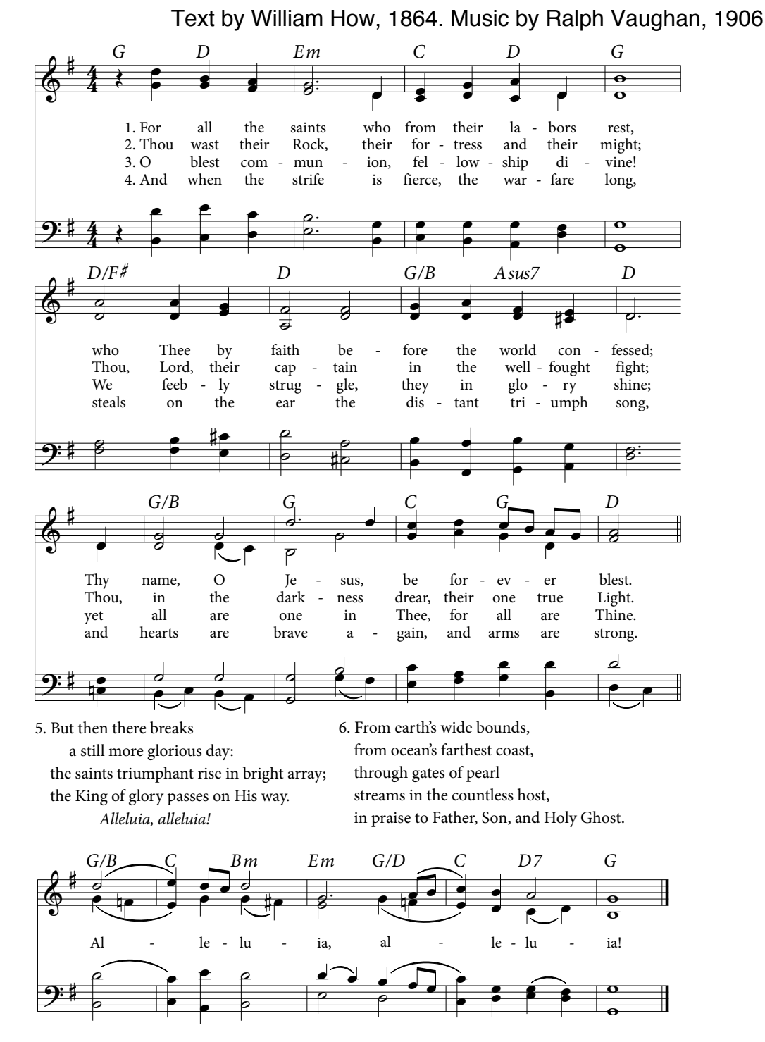
For All the Saints