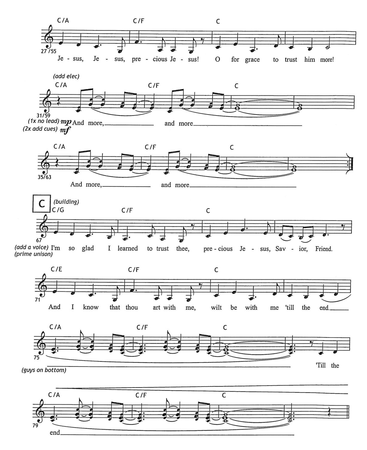
*Prayer of Adoration