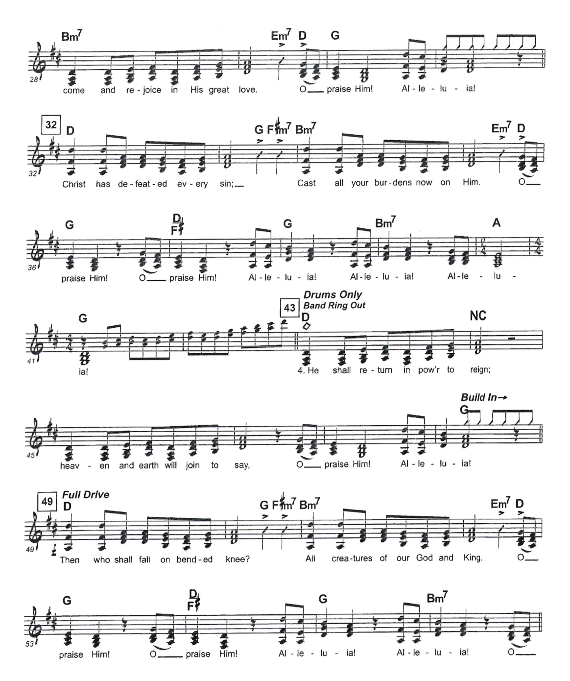
*Prayer of Adoration