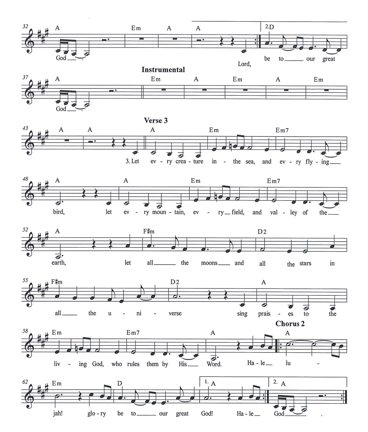
*Prayer of Adoration