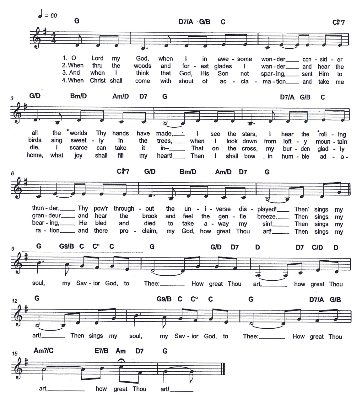
*Prayer of Adoration