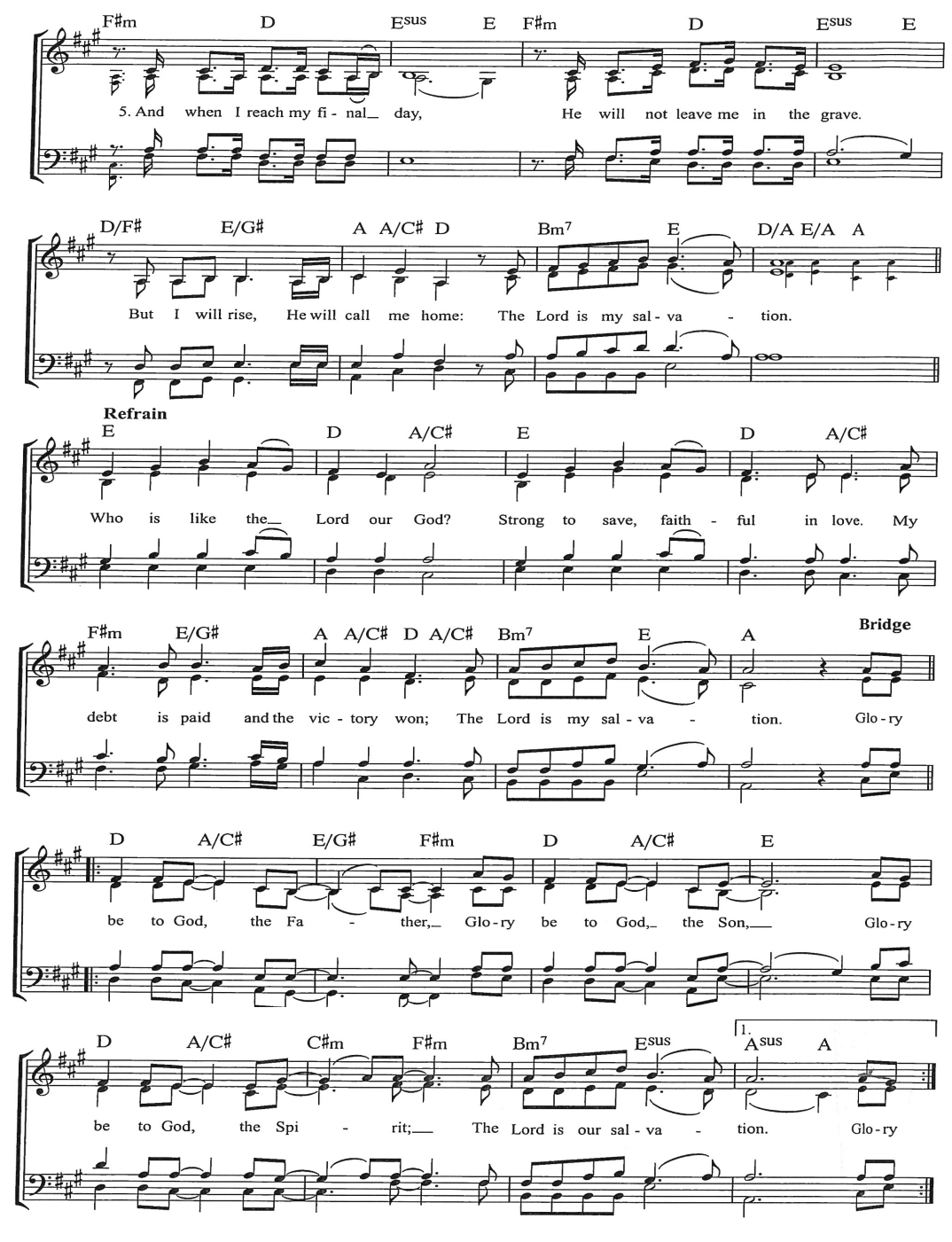
*Song of Adoration

It Is Well with My Soul Trinity Hymnal #691